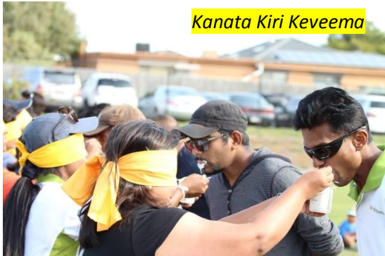
Kanata Kiri Keveema

Funniest game for couples was Egg throw and it showed the holding capacity among the couples in difficult situations though the most of eggs were not strength enough. Final stage for event was tug of war for kids, ladies and gents who used their maximum strength and team work to win the event. All the winners were prized by SriMithuru and almost all the prizes were sponsored by our generous donors. In addition to the winners all the kids were given a small prize for their attendance to the event. It was a bright sunny day and we were able to successfully conclude all the scheduled events by 5.00pm with the help of volunteers.