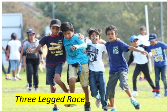
Three Legged Race

At evening session all the children under primary school age participated to 50m running event and Goni race. Meanwhile three legged race was popular among the secondary school children. Water filling competition was for the kids at kindergarten ages.