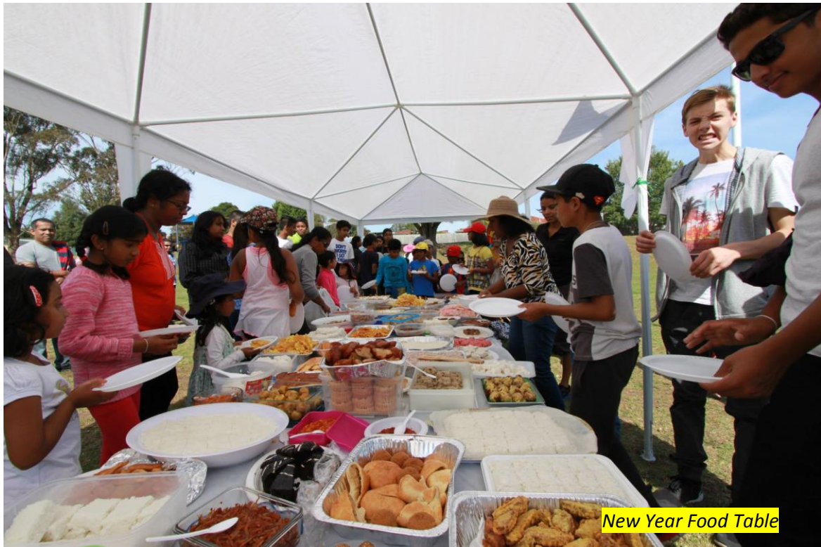
New Year Food Table

At evening session all the children under primary school age participated to 50m running event and Goni race. Meanwhile three legged race was popular among the secondary school children. Water filling competition was for the kids at kindergarten ages.