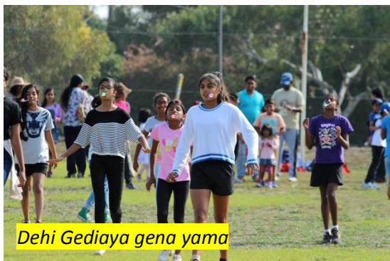
Dehi Gediya gena yema

Dehi Gediya Hende gena yema was for two aged groups of secondary school girls and post school girls.